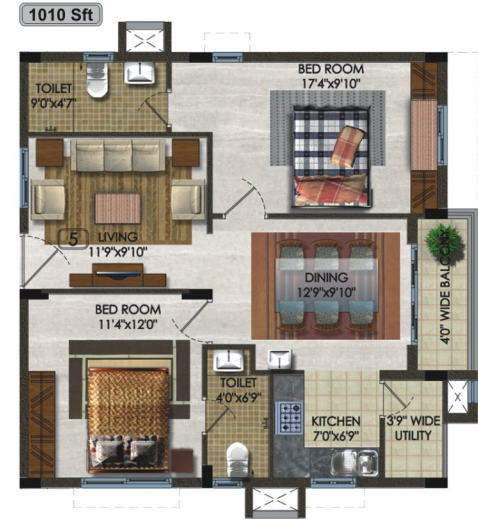
2 BHK - East Facing - 1010 Sft