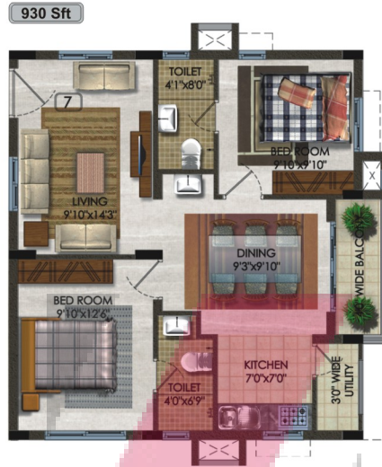
2 BHK - West Facing - 930 Sft