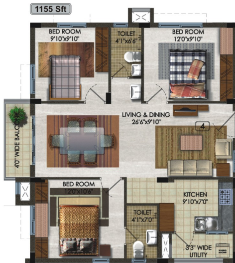
3 BHK - East Facing - 1155 Sft