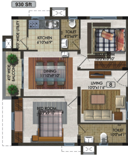
2 BHK - East Facing - 930 Sft