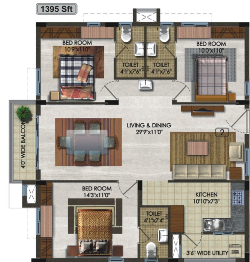
3 BHK - East Facing - 1395 Sft